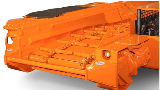
2 lengths provide ease of handling and easily configurable lengths: 3.96 m (13') & 0.5 m (19.5")