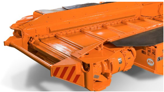
2 lengths provide ease of handling and easily configurable lengths: 7.5 m (24'7") and 0.62 m (2')