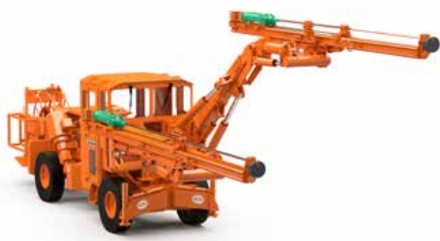
Ramp Runner 2 MB Jumbo