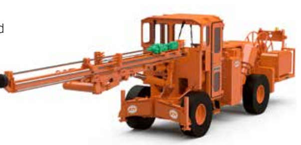
Drift Runner 1 SB Jumbo