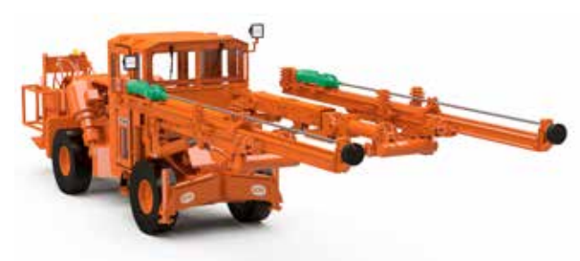
Drift Runner 2 SB Jumbo