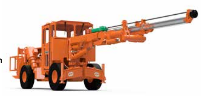
Ramp Runner 1 MB Jumbo

Designed for harsh underground environments, these booms come with a automatic parallelism feature that is designed into the hydraulic system of the booms.