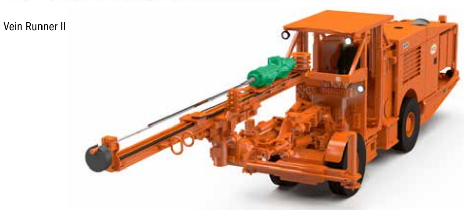
Joy NV-1 Jumbo

• Montabert HC Series Drifter & Intelsense Drilling Control System The Montabert HC series drifter and Intelsense drilling control system work seamlessly with all Joy jumbos, ensuring the best possible drilling performance.