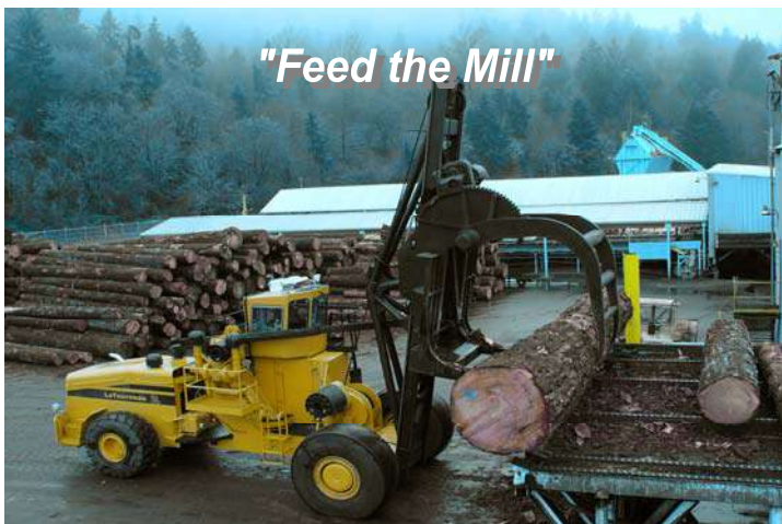
"Feed the Mill"