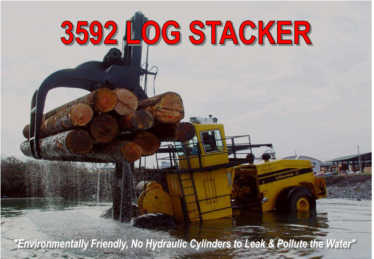
"Environmentally Friendly, No Hydraulic Cylinders to Leak & Pollute the Water"