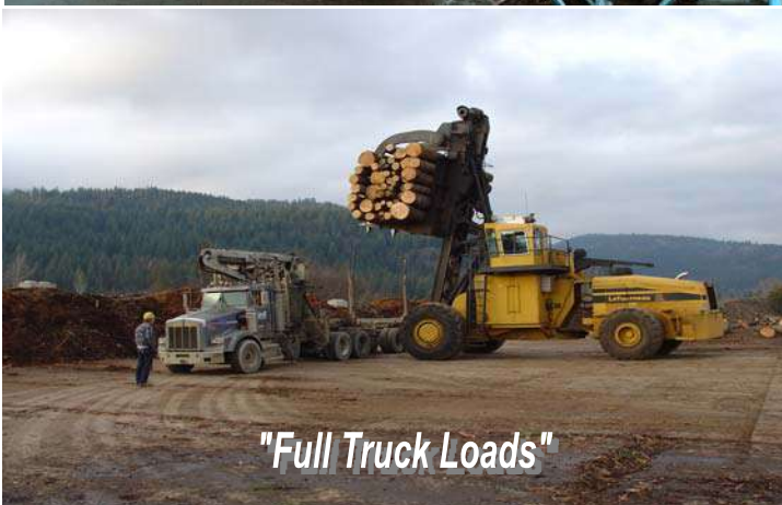
"Full Truck Loads"