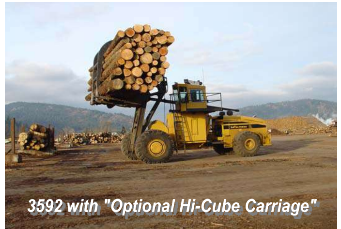
3592 with "Optional Hi-Cube Carriage"