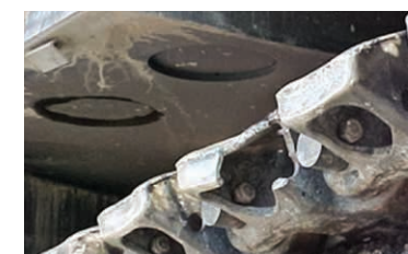
Damaged pin bores