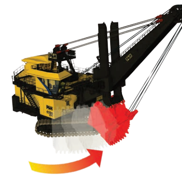
Dipper to crawler shoe contact can occur when digging in close proximity to the tracks and during the "return to tuck" part of the dig cycle.