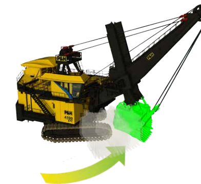
The Track Shield system assists the operator by generating an alternate path.