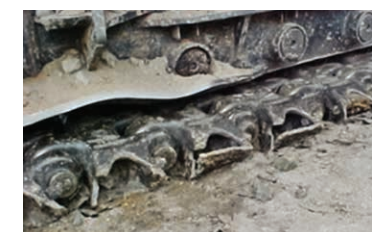
Cracked or rounded

The Track Shield system helps increase shovel availability and productivity by helping to mitigate these types of damage.