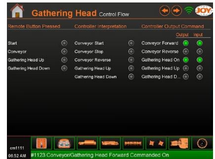
Gathering head control flow