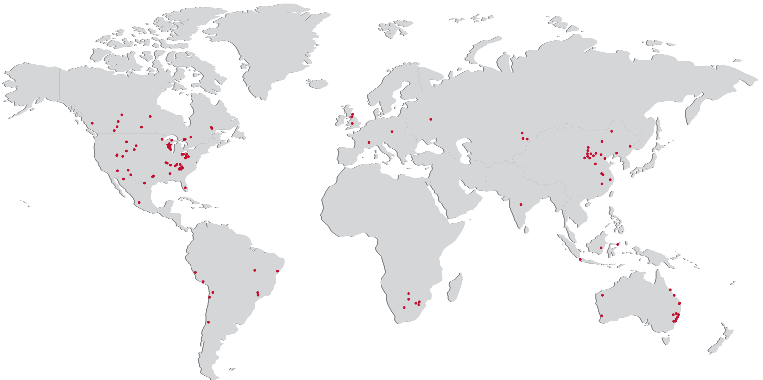
Joy Global worldwide locations